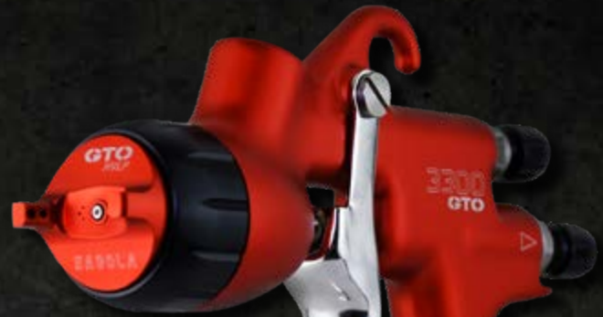
3300 GTO CAR version