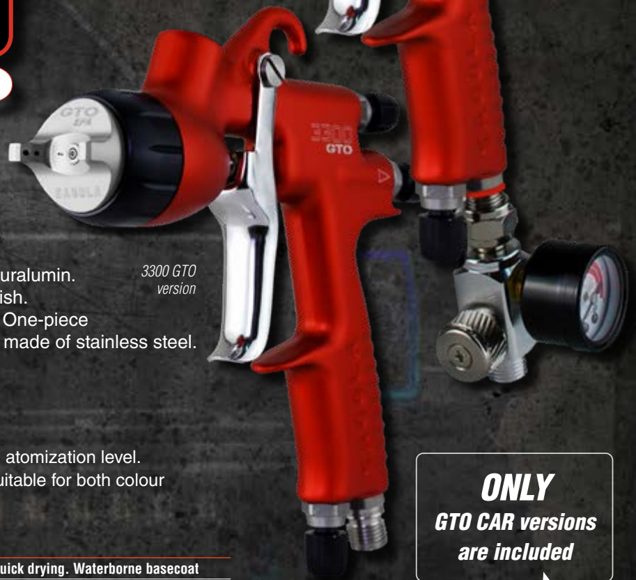
3300 GTO version