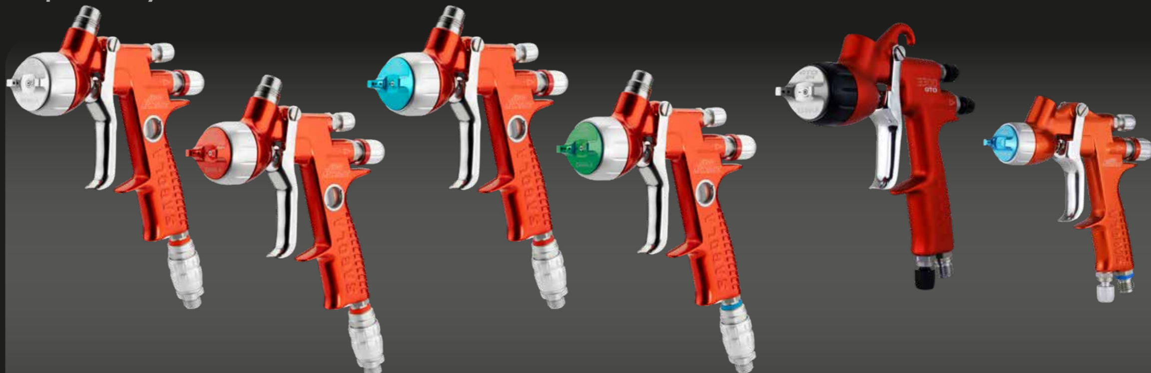
4600 Xtreme TITANIA PRO